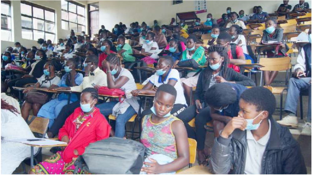
TRAINEES IN LECTURE HALL