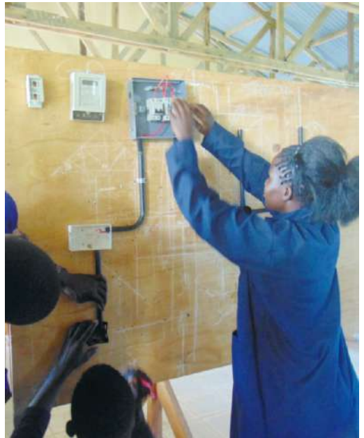
TRAINEES IN PRACTICAL SESSION